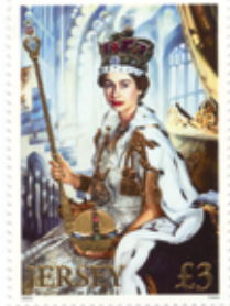
Royal Golden Jubilee