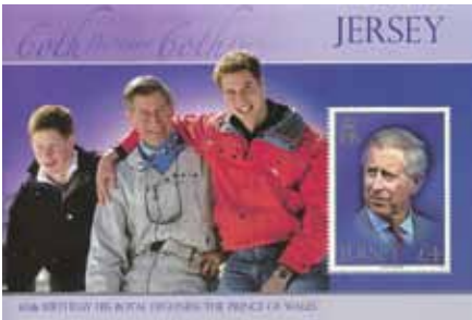
Prince of Wales 60th Birthday