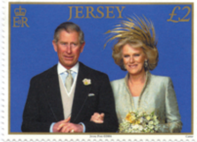
Royal First Wedding Anniversary

Our range of definitives are available for a least five years from issue date or until stocks are depleted. See our stock list and order form for details and prices.