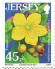
Wild Flower Definitives