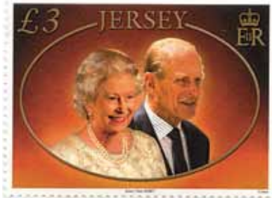
Royal Diamond Wedding Anniversary